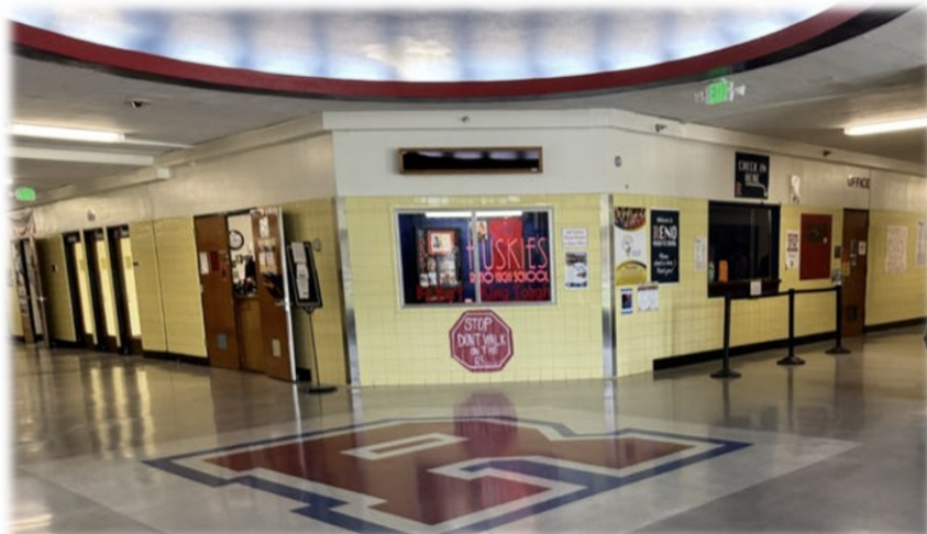
Reno High School's dome entrance

Reno High School remains an academic powerhouse. Spread the word!