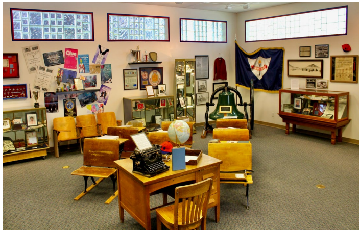
Old Meets New in Achievement Hall