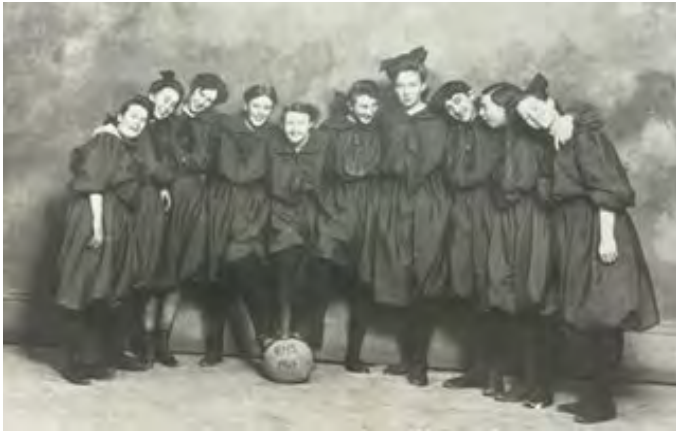
1905 RHS Girls Basketball Team Picture donated by Kevin McCullough