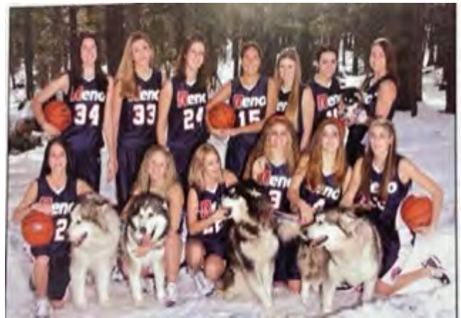
And 100 years later – the 2005 Girls Basketball Team.