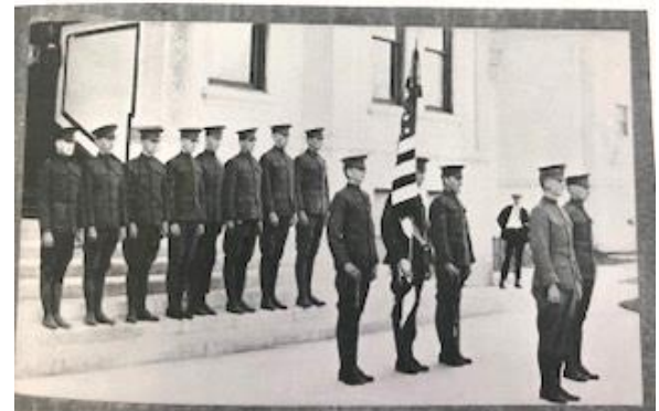
First JROTC Color Guard - 1920