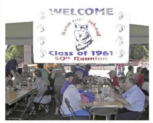
CLASS OF 1961 TENT