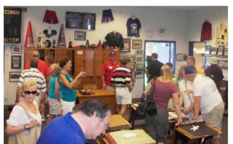
VISITING THE MUSEUM