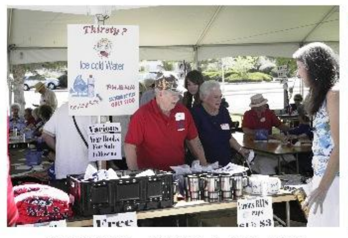
RHS ALUMNI ITEMS FOR SALE