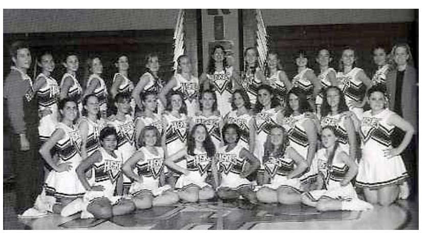
1999 Flag & Dance Team

Becoming one of Nevada's premier drill teams has not come without difficulty for the Huskiettes. The team practices on an average of 10 hours a week during sports seasons. Such dedication has earned them first place in two competitions at the University of Nevada, Reno and included winning the honor of being named best drill team in Northern Nevada.