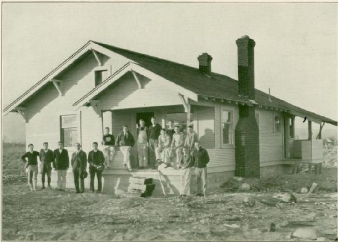
FOUR HUNDRED AND SEVENTY-SEVEN EAST NINTH STREET