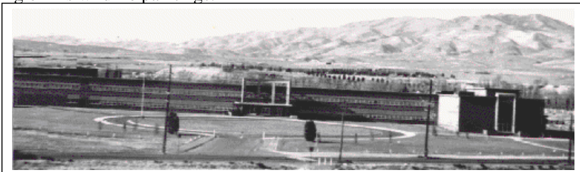
Reno High School - 1955