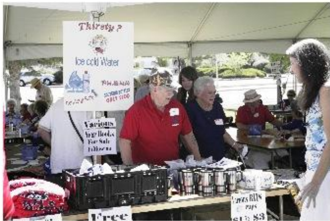
RHS ALUMNI ITEMS FOR SALE