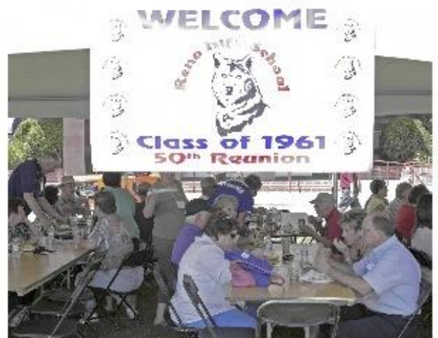
CLASS OF 1961 TENT