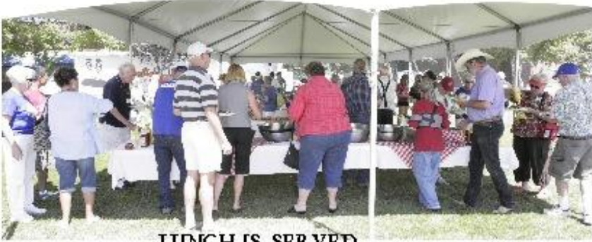
LUNCH IS SERVED