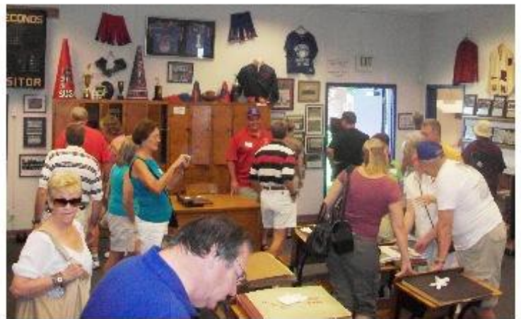
VISITING THE MUSEUM