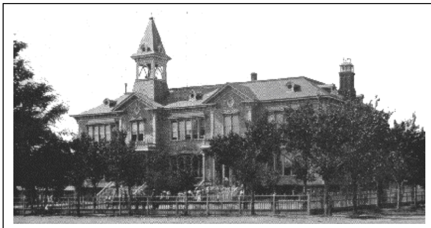
Reno High School 1879